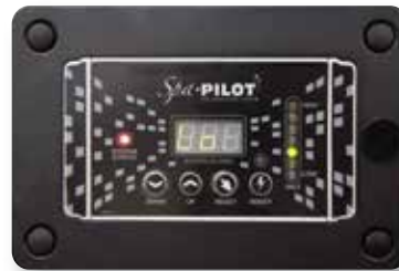
Flush Mount Into Spa