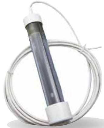
Over the Wall Cell